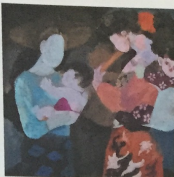
Mother/daughter exhibition Tang Ying &amp; Tang Li