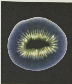
Claire Virgona, Small Edible Perspective I