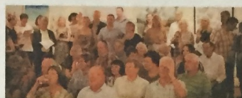
2012 Artist of the Year opening night